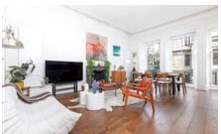
Ennismore Gardens, London, SW7 £1,295 pw