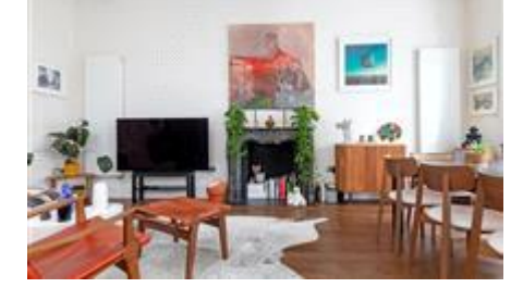
A beautifully refurbished west facing one bedroom first floor apartment overlooking this Knightsbridge garden square.