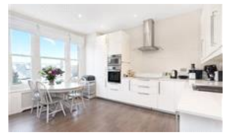
Avondale Mansions, SW6 £625 pw