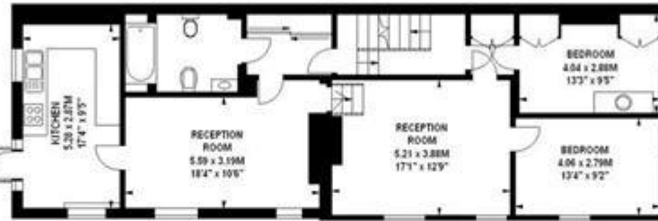
First Floor 1117 sq ft