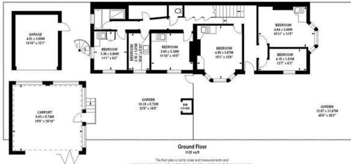
Ground Floor 1125 sq ft

The floor plan is not to scale and measurements and areas shown are approximate and therefore should be used for illustrative purposes only. The plan has been prepared in accordance with the RICS code of Measuring Practice and whilst we have confidence in the information produced, it must not be relied on. If there is any aspect of particular importance, you should carry out or commission your own inspection of the property. Copyright of FeaturePRO.