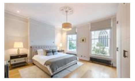
An outstanding, beautifully refurbished family house in the heart of Kensington laid out over four floors. The property boasts fantastic living space, wooden floors throughout and off street parking.