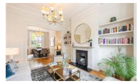
Scarsdale Villas, W8 £4,250 pw