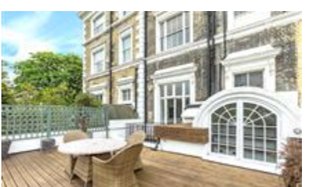
Onslow Gardens, London, SW7 £950 pw