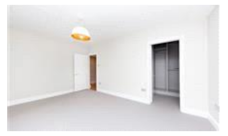
A recently refurbished, bright and well-proportioned 3 bedroom apartment with its own street entrance and private rear garden in this beautiful and grand stucco-fronted period house. NO HMO LICENCE