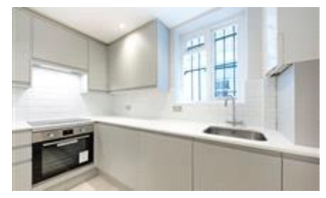
Priory Road, NW6 £695 pw