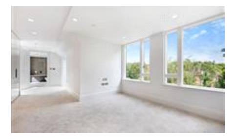
A stunning penthouse apartment located within the band new development Hampstead Manor, located in the heart of leafy Hampstead.