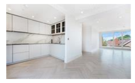
Rosalind Franklin House NW3 £1,750 pw