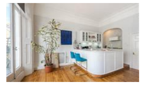
Collingham Place SW5 £675 pw