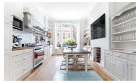
This stunning duplex (approx. gross internal area: 1,235sq.ft/114.73sq.m) is located within a few moments walk of the famous Queen's Club in Palliser Road.