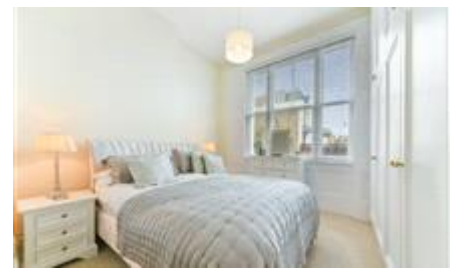
A stunning two-bedroom apartment on the first floor of this well maintained period building.