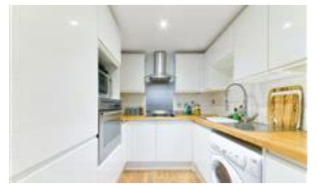
Cornwall Gardens, SW7 £1,350 pw