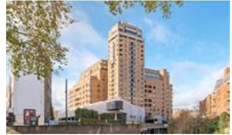
Point West, SW7 £625 pw