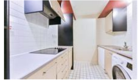
A charming split level two bedroom flat located in the Point West development with 24hr concierge, lift and gym facilities (extra charges applicable).