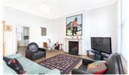
Abingdon Road, W8 £995 pw