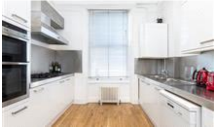
A spacious maisonette situated just off Kensington High Street and moments from Holland Park.