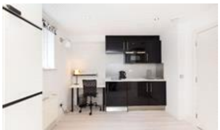
Queens Gate, SW7 £350 pw