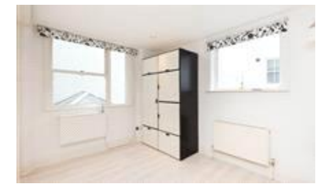
Studio flat situated in period conversion consists of open plan kitchen and shower room with ample storage.