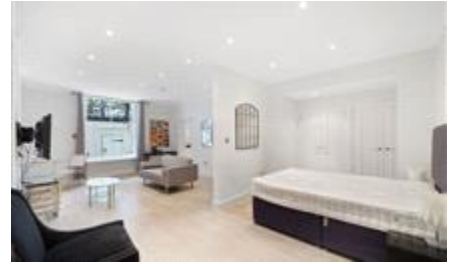
Cornwall Gardens, London, SW7 £525 pw