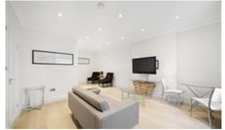
A bright, stylish studio flat with wooden floors and sleek contemporary design.