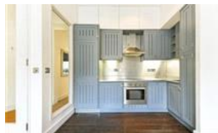
Onslow Gardens, SW7 £650 pw