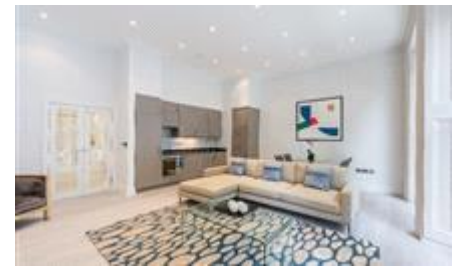
A beautifully and well presented one double bedroom first floor flat overlooking Cornwall Gardens in a period stucco fronted building.