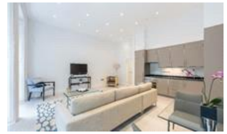
Cornwall Gardens, SW7 £995 pw