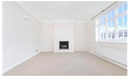
A substantial family house with garage in this pretty residential street between Kings Road and Chelsea Green.