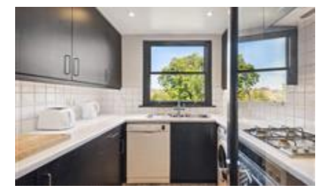
This fully furnished flat in SW5 has it's own private balcony and and red brick exterior.