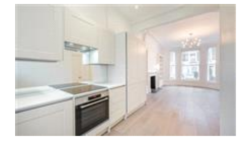
A fabulous 3-bedroom maisonette on the raised ground and lower ground floors of this converted period building.