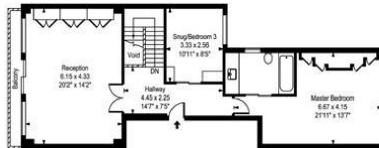
Raised Ground Floor

Approx Gross Internal Area 1702 Sq Ft - 158.12 Sq M