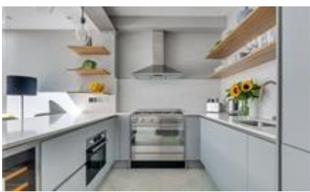
Archel Road, W14 £975 pw