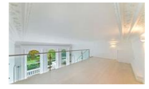
A stunning first floor, one bedroom apartment overlooking communal gardens.