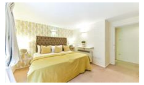
Point West, Cromwell Road, SW7 £461 pw