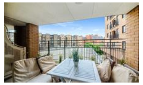
A lovely one bedroom apartment situated in this sought after building in the heart of South Kensington.