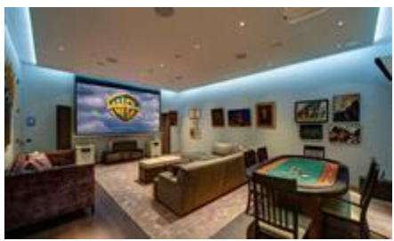
Princes Gate, SW7 £13,500 pw