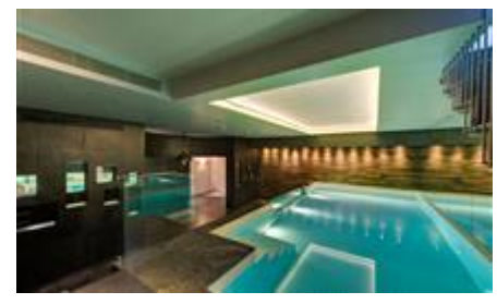
A breath-taking five bedroom triplex renovated to exacting standards throughout including an indoor swimming pool.