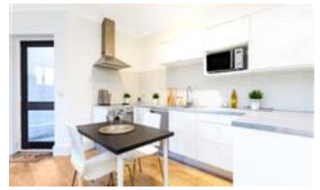
St Helens Gardens, W10 £325 pw