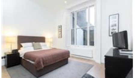
A stunning and impeccably presented spacious one bedroom apartment in the heart of South Kensington. The property is fully furnished and available immediately.