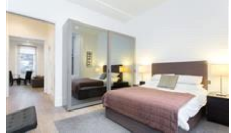
Cromwell Road, SW7 £450 pw