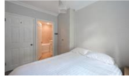
Well-proportioned two bedroom apartment in this beautiful Victorian conversion building.