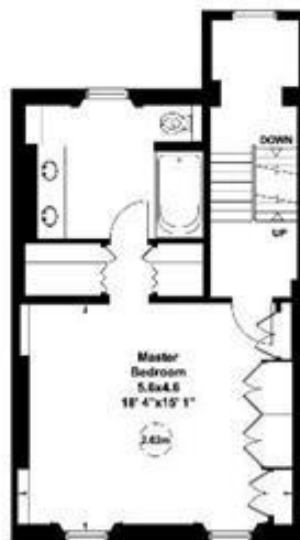
Second Floor Gross internal area (approx.) 59 Sq m (641 Sq ft)