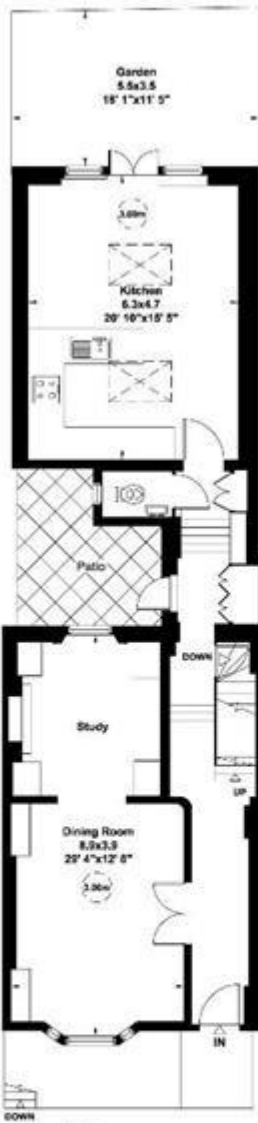
Ground Floor Gross internal area (approx.) 84 Sq m (907 Sq ft)