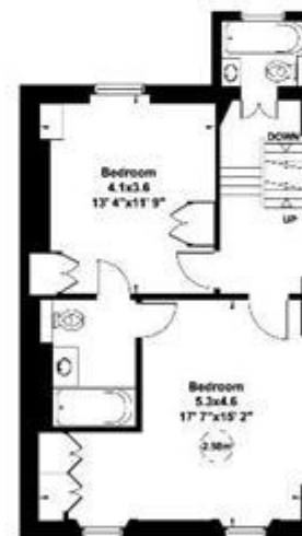
Third Floor Gross internal area (approx.) 60 Sq m (658 Sq ft)