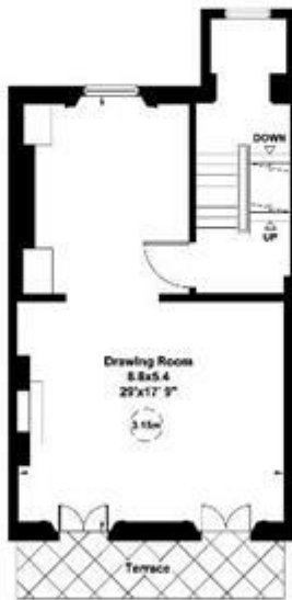
First Floor Gross internal area (approx.) 49 Sq m (532 Sq ft)