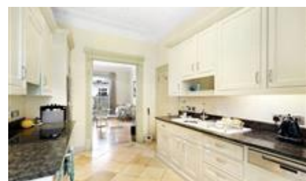
Thurloe Street, SW7 £3,950 pw