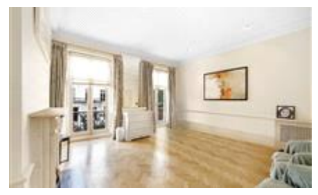
A large white stucco fronted five bedroom house in a prime location in the heart of South Kensington with private garden.