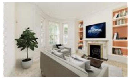
Observatory Gardens, W8 £2,550 pw