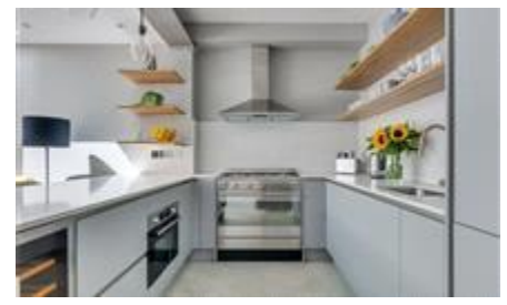
Archel Road, W14 £975 pw