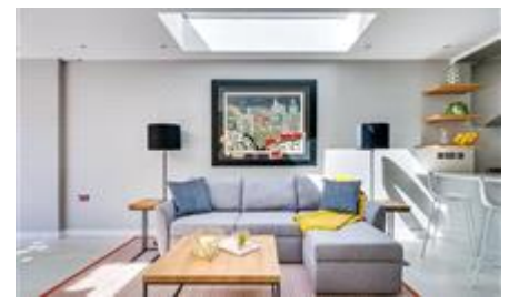
A brand new, beautifully finished garden maisonette finished to the highest of standards throughout.