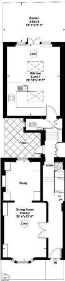
Ground Floor Gross internal area (approx.) 84 Sq m (907 Sq ft)