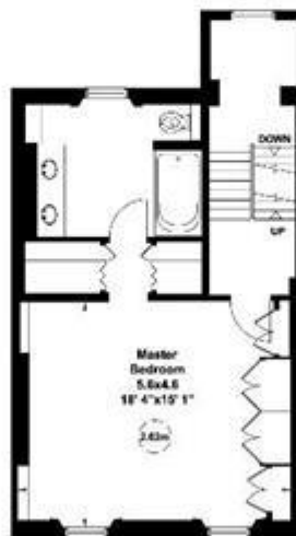
Second Floor Gross internal area (approx.) 59 Sq m (641 Sq ft)