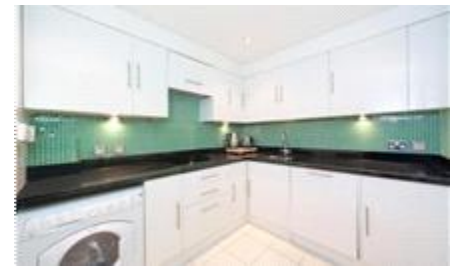
Manson Place, SW7 £650 pw