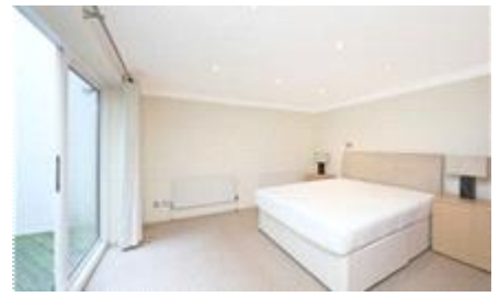
A spacious two bed, two bath apartment with a private patio in a well maintained converted building.