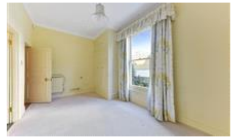
An exceptional two bedroom flat on the raised ground floor of a beautiful white stucco-fronted Victorian conversion and access to 2 private gardens with tennis court.