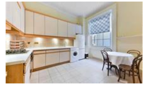
Onslow Square, SW7 £1,000 pw