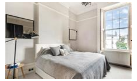
A bright, spacious and wellproportioned First Floor one double bedroom apartment with a separate kitchen/breakfast room, balcony and utility room in this recently refurbished stucco fronted period building.