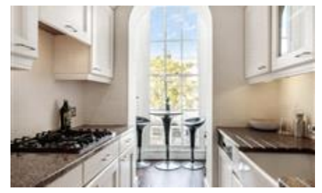
Abercorn Place NW8 £495 pw