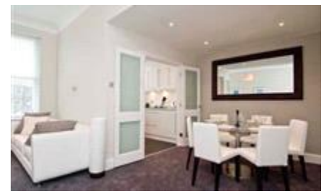
Lexham Gardens, W8 £575 pw