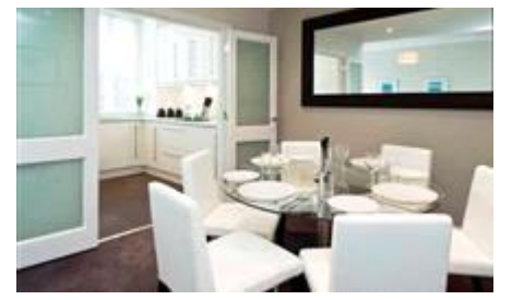
A bright and spacious two bedroom, two bathroom flat located within walking distance of the ever-popular High Street Kensington.