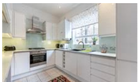
Ifield Road, SW10 £425 pw