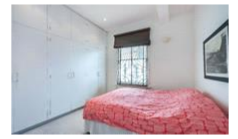
Superb bright and spacious one bedroom apartment on the second floor (no lift) on the desirable residential street of Ifield Road close to Earl's Court Tube (District and Piccadilly lines).