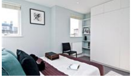
The Westbourne, 1 Artesian Road W2 £600 pw