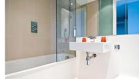
A two bedroom apartment in a large well managed building with communal gardens. Recently refurbished it is situated on the highly desirable Westbourne Grove in this well maintained portered block.