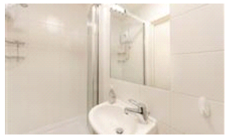
This super second floor studio apartment is ideally located for all the shops and amenities of Earls Court.