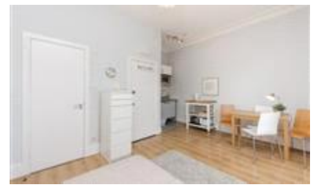
Finborough Road,London, SW10 £250 pw