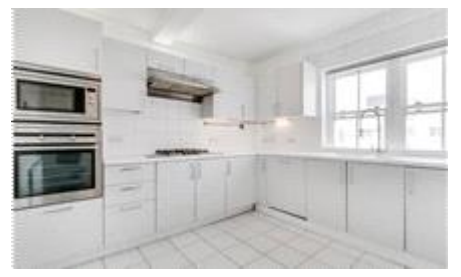
A well presented three bedroom duplex apartment with roof terraces and direct lift access.